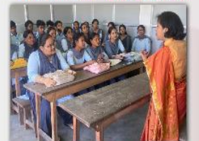
Faculty Exchange Program