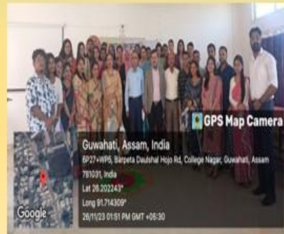
DEPARTMENTAL ALUMNI MEET, 2023