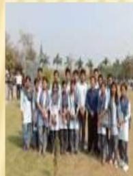
Visit to IITG

They are valuable assets to employers due to their skills and knowledge to navigate and understand economic systems and trends