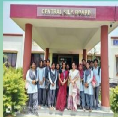
VISIT TO CENTRAL ERI SILK FARM, TOPATOLI, ASSAM