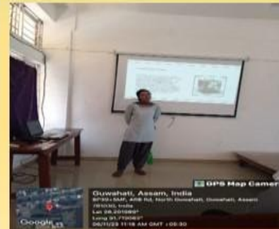
POWERPOINT PRESENTATION BY STUDENTS