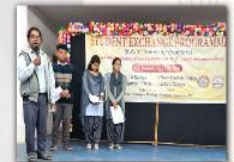
Students' Exchange Program