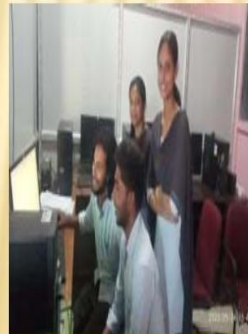
Students in Dept Lab