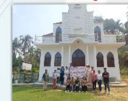
Educational Field Trip