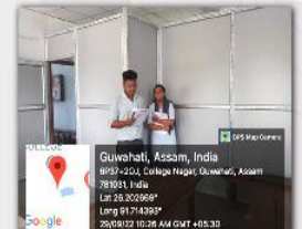
Departmental Seminar Presentation