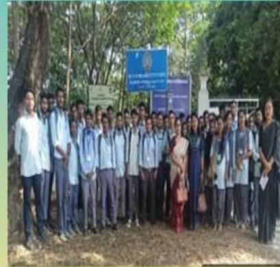
VISIT TO AQUACULTURE AND BIODIVERSITY CENTRE, GAUHATI UNIVERSITY