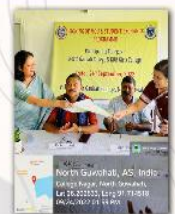
Signing of MoU