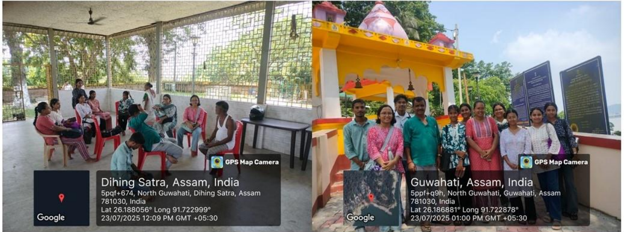
Fig. 2: Students doing internship at ABILAC Guwahati