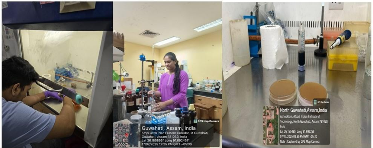
Fig. 1: Students doing experiments at IIT Guwahati