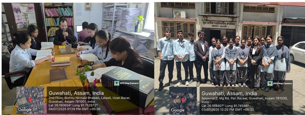
Fig. 5: Students doing internship at Gauhati High Court, Guwahati