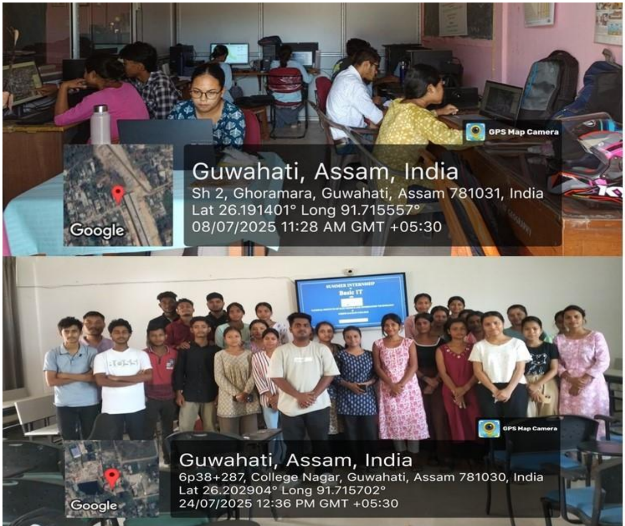
Fig. 4: Students doing internship at Accelcraft, Guwahati and NIELIT, Guwahati