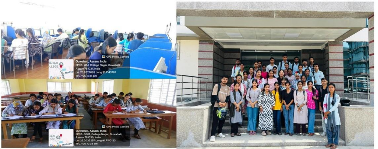
Fig. 3: Students doing internship at TRTC Guwahati