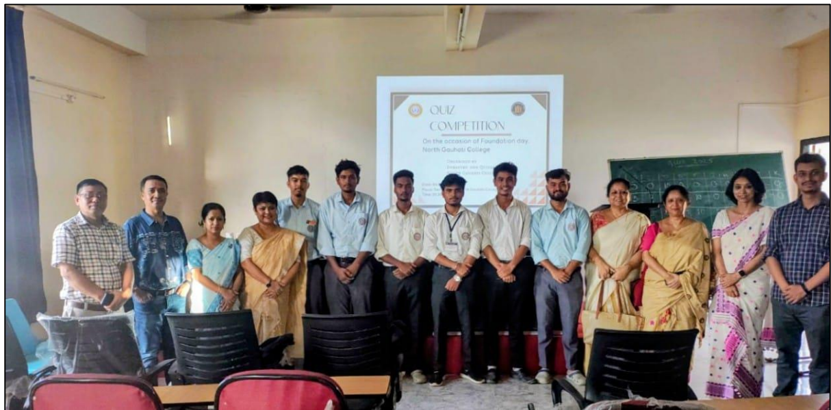
The winners of the Quiz Competition with the Faculties and Members of the Debaters' and Quizzers' Forum

The programme concluded on a successful note, with the organisers expressing their appreciation to all participants for their active involvement and extending their best wishes to the selected teams for their future endeavours.